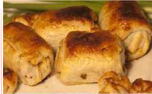
Baked, ready to enjoy